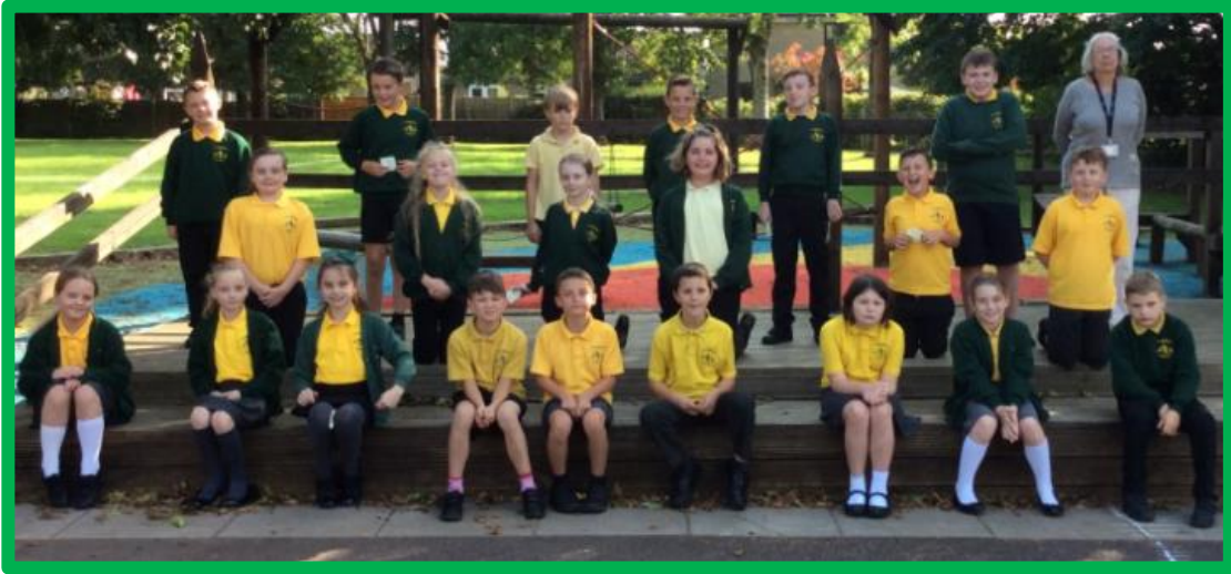
YEAR 5 WOOD- PECKERS