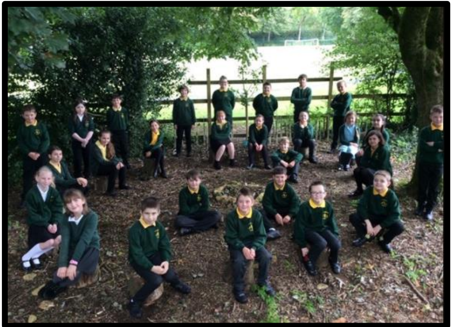
YEAR 6 BLACK- BIRDS