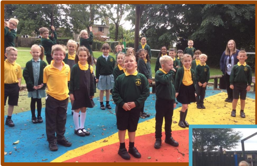
YEAR 3 OWLS