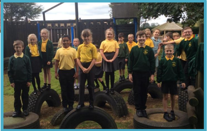
YEAR 4 FINCHES