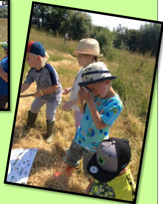
Meadow sweep Sweeping for Minibeasts!