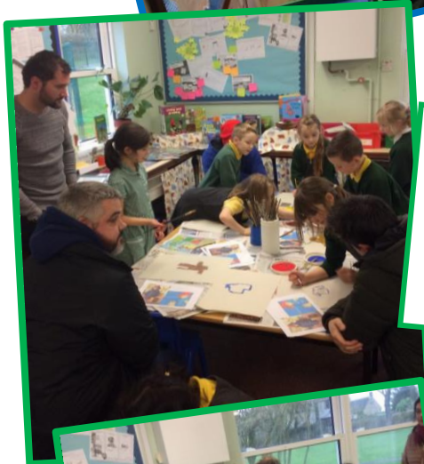
Y2 Paddington: Where? What? Who?