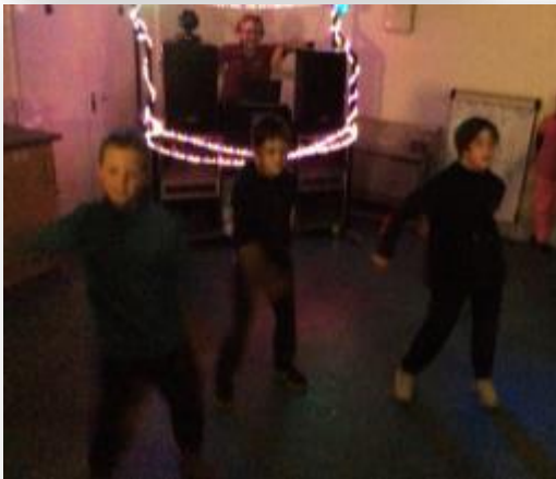
The disco highlighted great talents including flossing and break dancing.