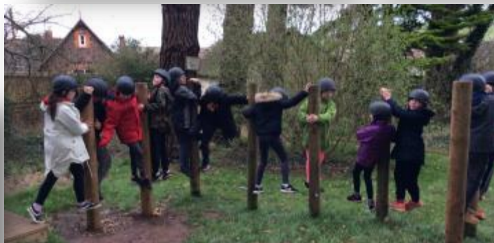
The children faced and overcame many challenges. They supported each other well.